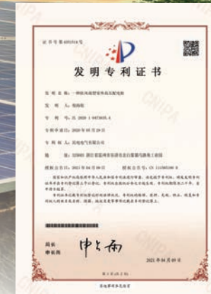
PATENT FOR INVENTION