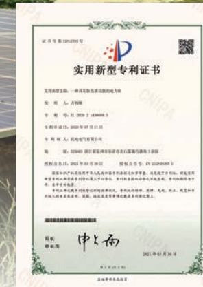
UTILITY MODEL PATENT CERTIFICATE