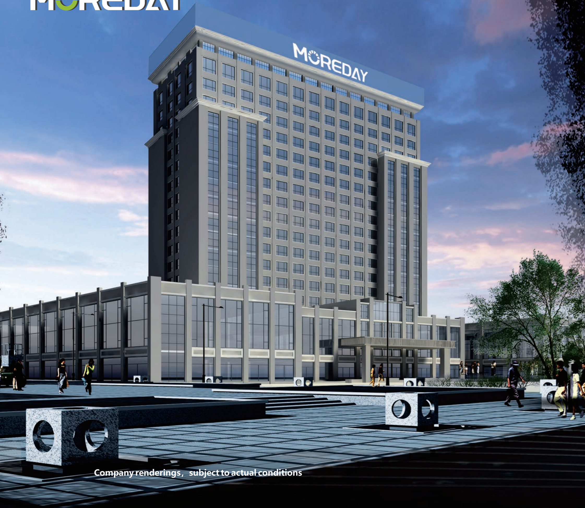
Company renderings, subject to actual conditions