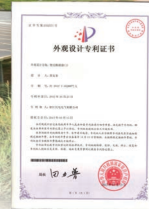
DESIGN PATENT CERTIFICATE