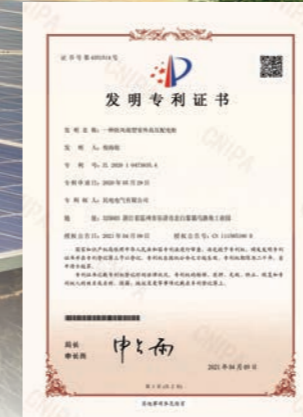
PATENT FOR INVENTION