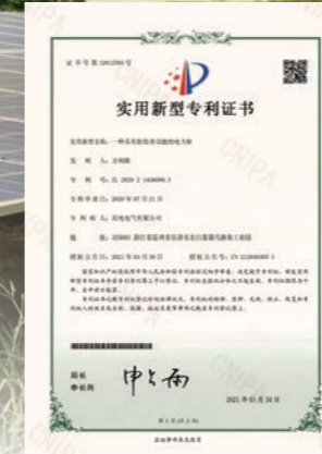
UTILITY MODEL PATENT CERTIFICATE