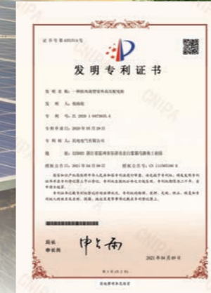
PATENT FOR INVENTION