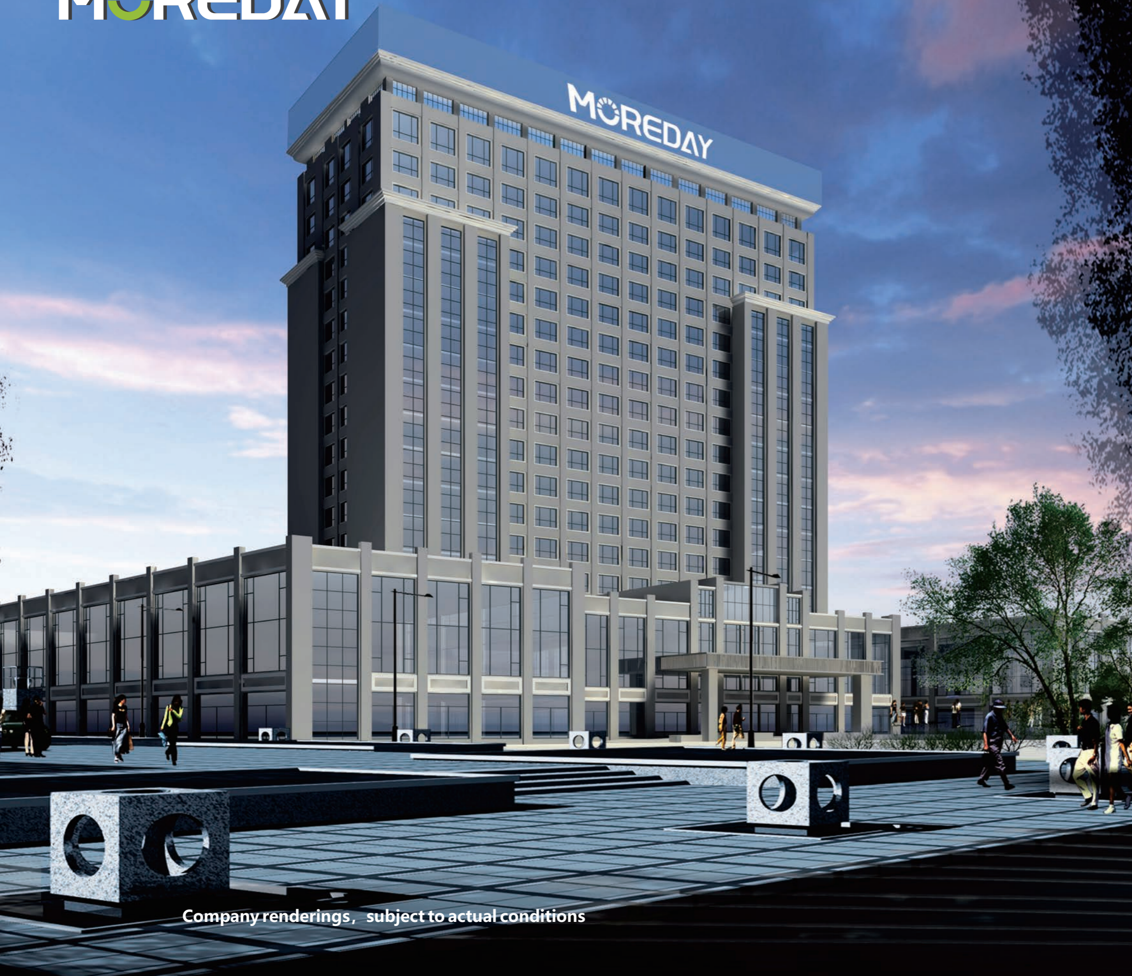
Company renderings, subject to actual conditions