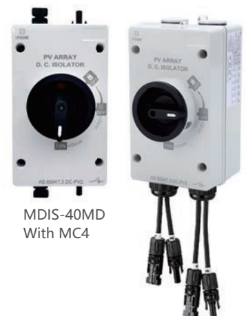
MDIS-40MD With MC4