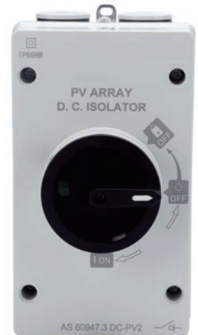
MDIS-40MD With breathing valve