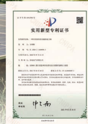
UTILITY MODEL PATENT CERTIFICATE