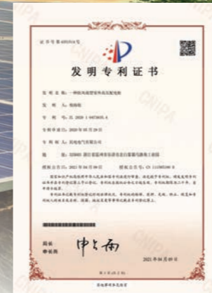
PATENT FOR INVENTION