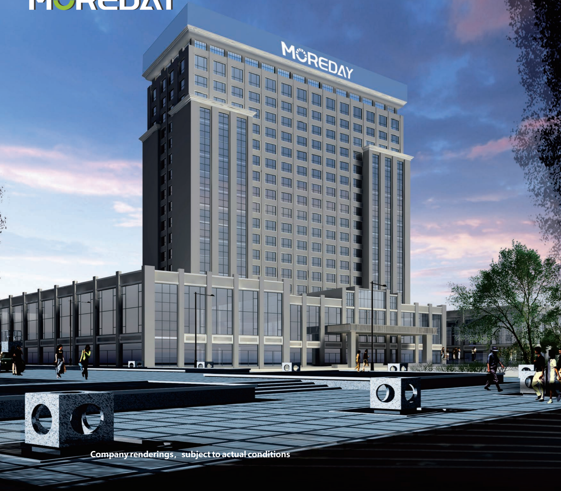
Company renderings, subject to actual conditions