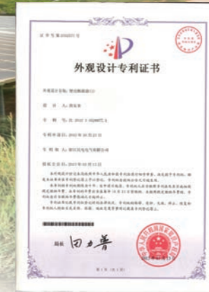
DESIGN PATENT CERTIFICATE