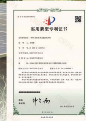
UTILITY MODEL PATENT CERTIFICATE